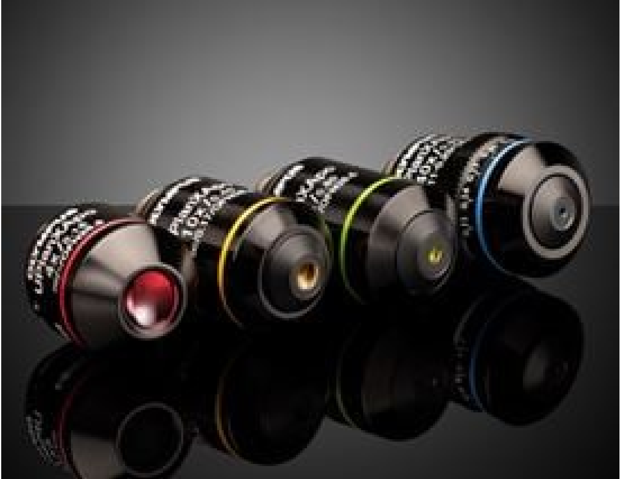
Olympus X-Line Extended Apochromat Objectives