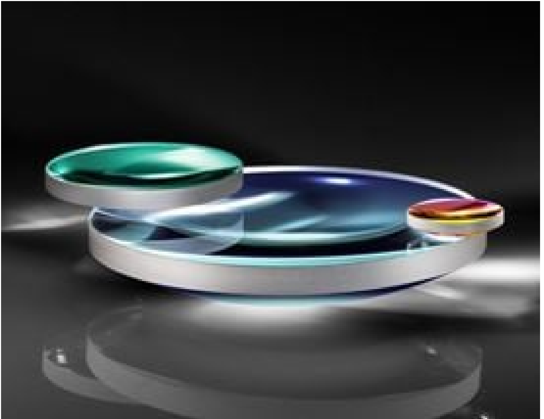
633nm Laser Line Coated Plano-Convex (PCX) Lenses