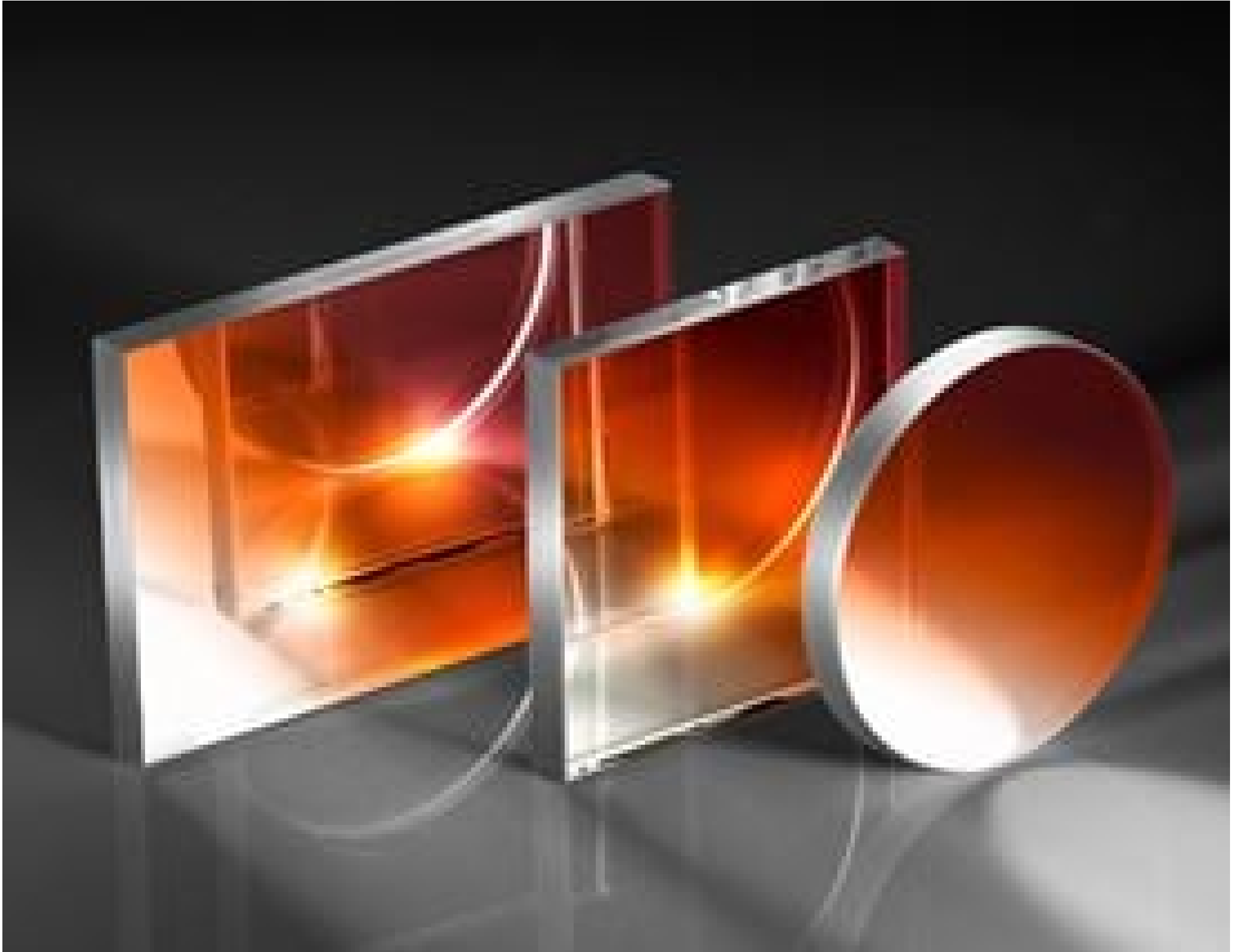
Visible and NIR Plate Beamsplitters