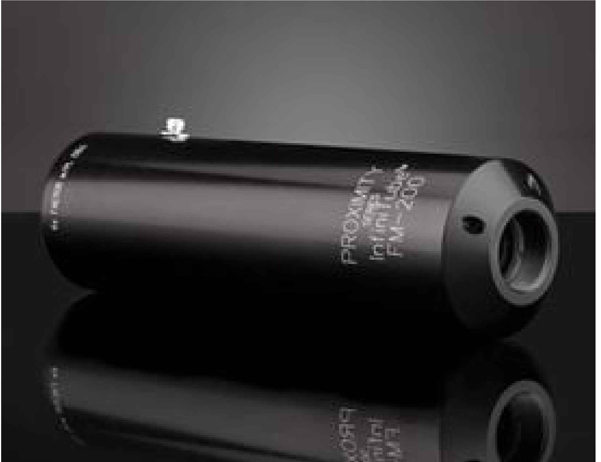
InfiniTube FM-200 (1X), #58-310

See More by Infinity Photo-Optical Company